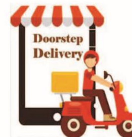
DOOR DELIVERY THROUGH ONLINE