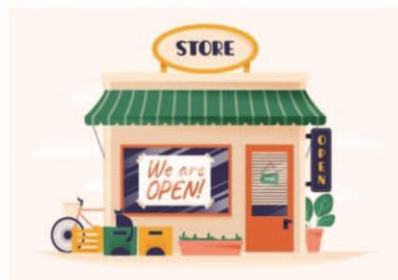
DIRECT PURCHASE FROM OUR STORE