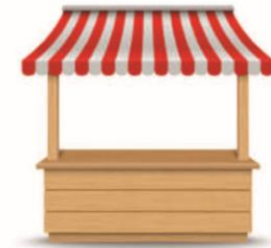
STALL AT SCHOOL PREMISES