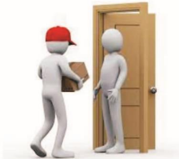
DOOR DELIVERY TO SCHOOL